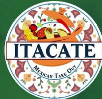
ITACATE FOOD TRUCK