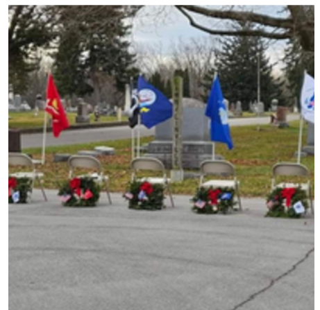
Each Branch of Service Receives a ceremonial Wreath, placed by Honor Veterans