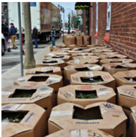
Staging of Whitley County Wreaths, and Volunteer pickup for the upcoming National Wreath Day. Those in forefront of picture headed to South Whitley Cemetery

This heartfelt effort embodies the mission to Remember, Honor, and Teach – ensuring that the legacy of our nation's heroes lives on in our community.